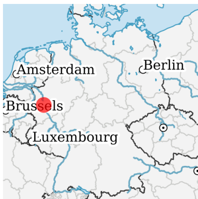
Location in germany