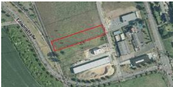
Verfügbare Flächen Borsigstraße.jpg